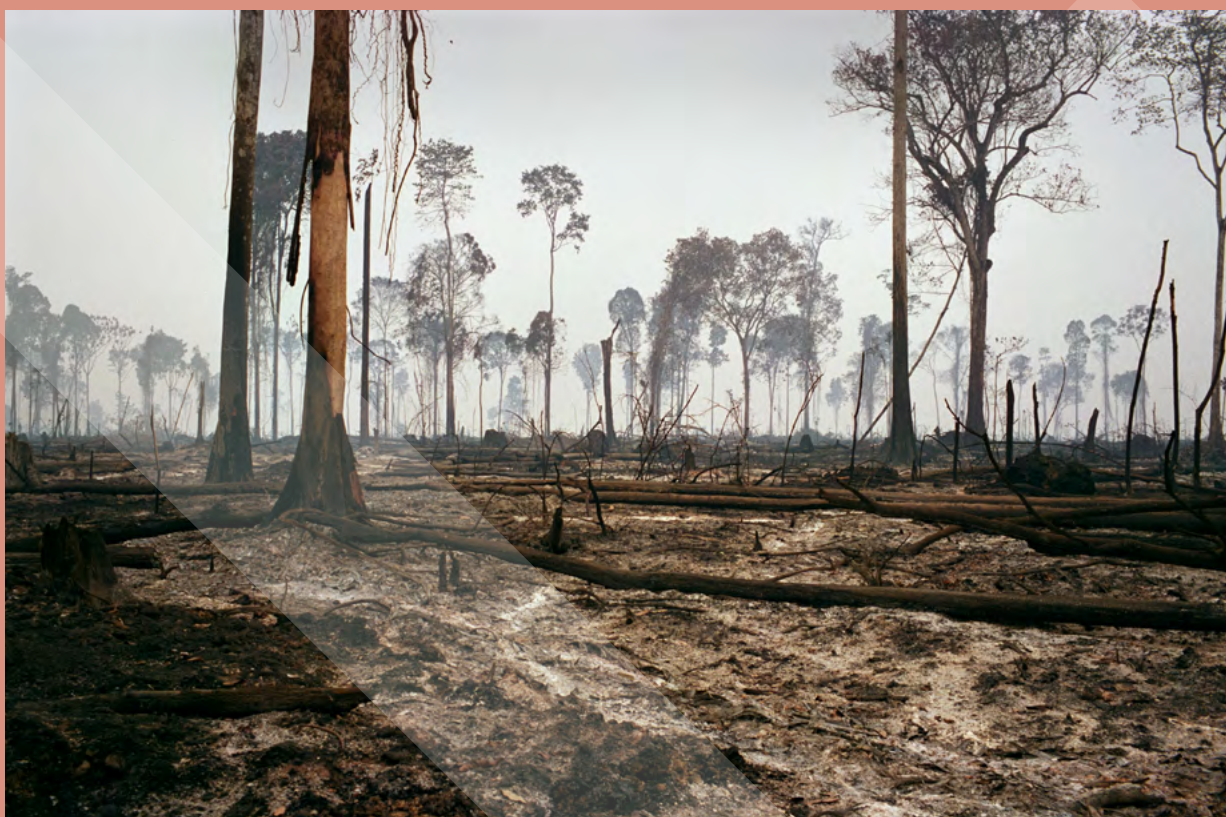
An area of deforestation on the border of the Amazon rainforest in Pará State, Brazil, burned down to produce charcoal and to grow soybeans or raise cattle.

While a comprehensive list of mandatory matters to be investigated as part of a product-based due diligence framework may give the initial impression of implying an administrative burden, it is important to recognise that due diligence investigations are inherently risk-based exercises. The amount of work required will ultimately depend on the risk profile of the relevant FERCs and will be proportionate to the risks that businesses take in buying those commodities and structuring their supply chains. Operators would need to obtain information about and consider most of the matters listed above in order to assess the risk that their FERCs are linked to deforestation or forest degradation in any case. A comprehensive due diligence requirement will not only provide businesses with clarity as to their legal obligations and scope of their human rights responsibilities but would also support businesses to identify and address the human rights risk profile of their products, supply chains and operations. It is fundamentally in the interests of businesses to obtain a realistic and accurate understanding of their human rights risk exposure.