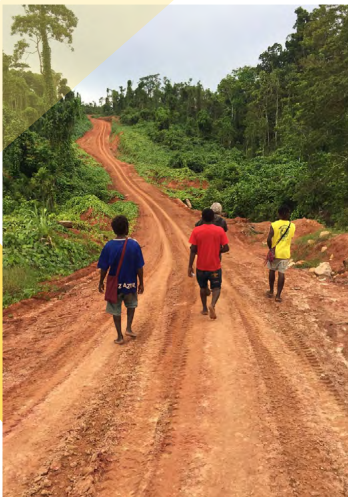
Customary landowners walking along logging road in illegally logged forest, New Hanover, PNG

Addressing the human rights dimension of deforestation and including requirements that ensure respect and protection for human rights in the Legislative Proposal is therefore necessary to satisfy the Commission's legal obligations to respect and protect human rights in the exercise of its law-making powers. At a minimum, this should be done by obliging EU operators to ensure, on the basis of their compliance with prescribed human rights due diligence requirements, that their FERCs are not linked to human rights risks or impacts before they are placed on the EU market. In order to comply with the obligation to protect human rights, the Legislative Proposal should also provide rights of redress before EU courts for victims of human rights impacts linked to FERCs placed on the EU market.